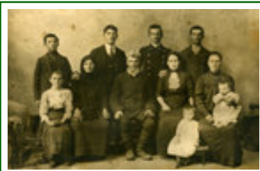
Modern ideas of a smaller, “nuclear” family may be deceiving – as often the extended family still affects the nuclear one and can even offer benefits.

The concept of the nuclear family unit – broadly defined as “a household consisting of a father, a mother and their children” – didn't exist before the 20 th century. (The Merriam-Webster dictionary first listed the term in 1947.) Nuclear families have certainly existed, but in